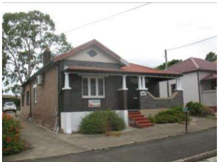
→ MDAA Office in Harris Park

I am looking forward to working with the wonderful staff and committee at MDA A and hope to grow and be enriched personally by my experiences at MDA A.